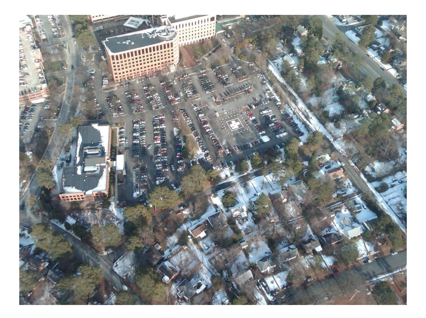
Attachment 1 Arial View of St. Mary's Hospital Helipad